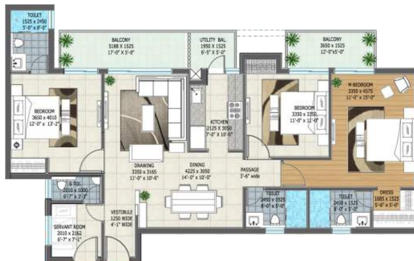
Unit 3 BHK + Servant Size 1765 Sq.ft.